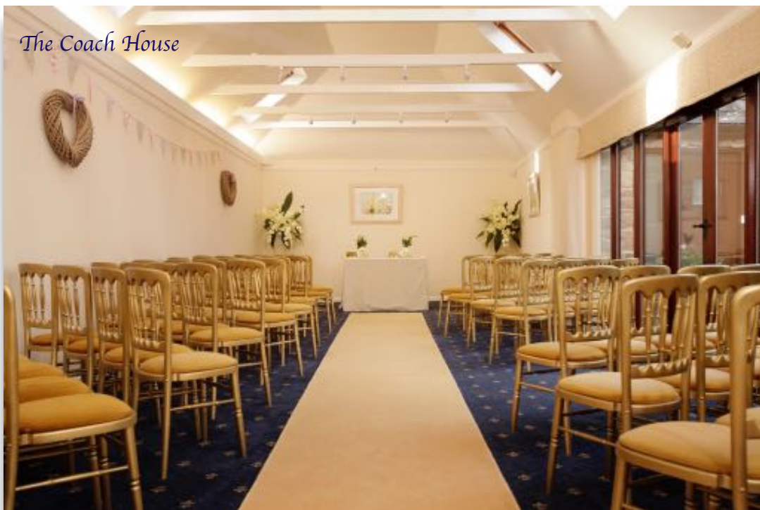
The Coach House

This room is licensed for up to 90 seated guests