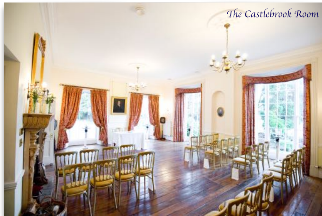
The Castlebrook Room

The Castlebrook room is a beautiful Georgian Drawing room in the Main House with glorious floor to ceiling windows. A fantastic view of the gardens and a wonderful amount of natural day light